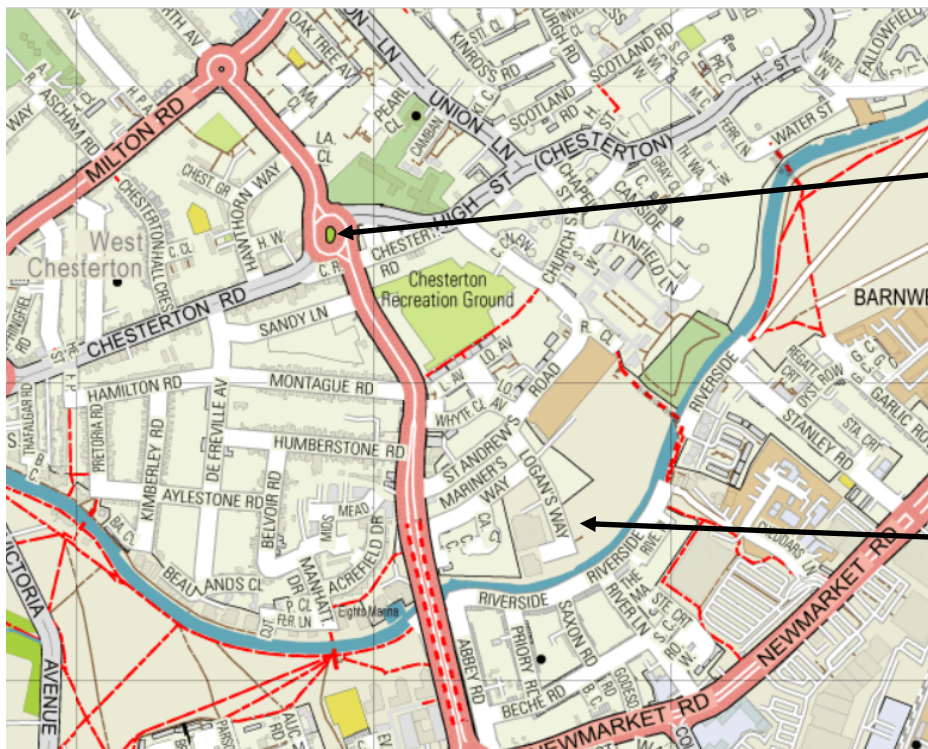
Elizabeth Way Roundabout

To find Combined Colleges Boathouse (post code - CB4 1BL) At the Elizabeth Way roundabout (at the end of Chesterton Road on the north side of the River Cam) take the 2nd exit past Elizabeth House (GE company building) heading to Chesterton High Street. Take the first right into Church Street, follow the road (flows into St Andrews Road) and go past St Andrews Church on your right, pass the large white office building (St. Andrew's House) and the Sepura offices (wavy roof). Take the next left into Logan's Way, passing an office car park on your left, and continue to the end of the road - the combined Colleges boathouse compound is through the gates. For visiting cars please park outside the compound to allow vehicles with trailers to park.